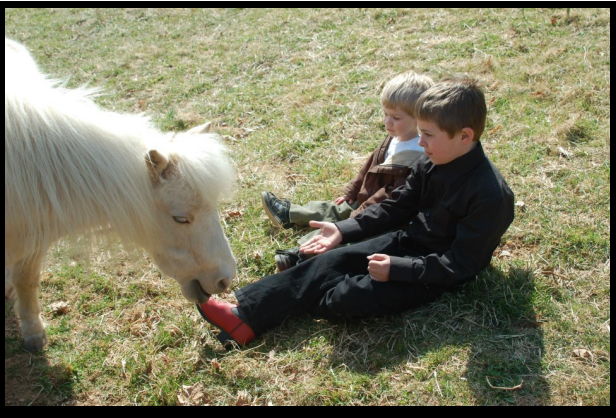
Horsemanship Day Camp